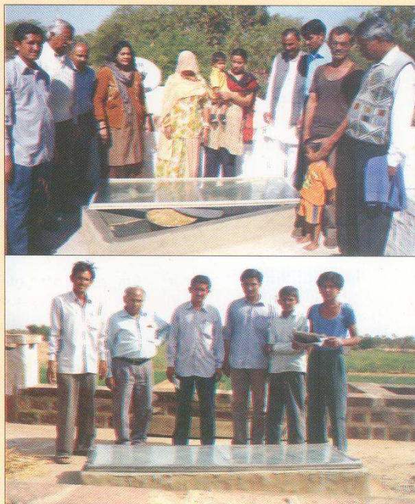
Fig. 2 Solar cookers for animal feed installed at village Osia

Twelve low cost solar cookers for animal feed were installed at village Osia (Fig.2). The body of the cookers has been fabricated by an unskilled labour. Animal feed mixture cotton seed and oil cake have been successfully boiled by the farmers.