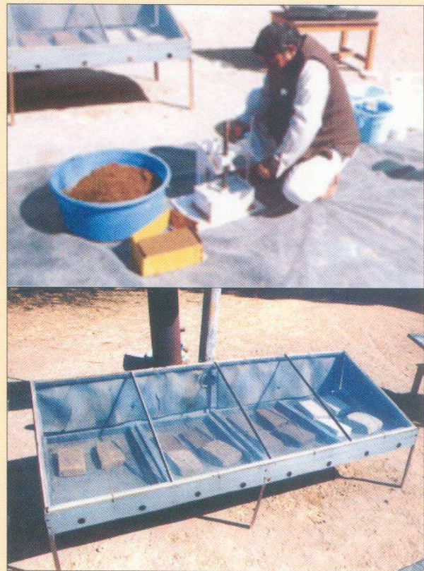
Fig. 2 : CAZRI'S Feed Block Production Technology

Establishment of feed block production unit at farmers' level was found to be economic proposition. The initial cost of establishment of village level production of 20 blocks/day, including cost of feed ingredients required for production of 100 blocks (Rs.1453/-), essential gadgets and drying oven, comes to Rs. 40,000/-. It excluded the cost of land and infrastructures. The production can be initiated in ventilated, asbestos shade of approx 70'x20', in which 2, 15'x20' spaces, situated at each end of the shade, can be used for storing the ingredients and finished blocks, and a central space of approx., 40'x20', provided with three phase electric connection for ingredient mixer, block press and draught type electric oven can work as production space. The cost of production of 100 blocks using feed grade jaggery